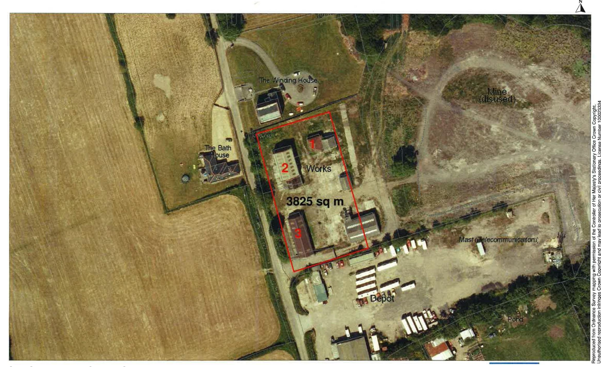
GT2 Stanton Wick Colliery Site 5 Pitch Appraisal Scale 1:1250 22 August 2012